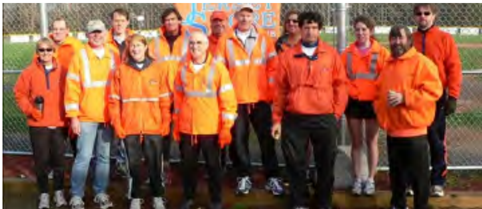
Volunteer Team JSRC gear up for the Navesink Challenge.