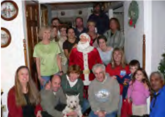
The JSRC Adopt-a-Family Crew.