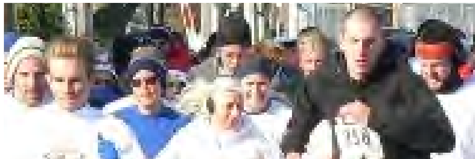
Jingle Bell Run start